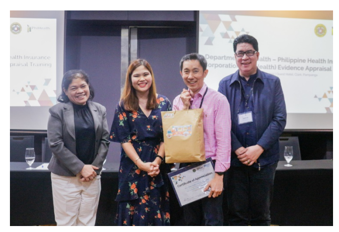
Figure 7: Workshop closing ceremony

As discussed earlier, HITAP has a history of supporting HTA efforts in the Philippines, and a guiding principle of the workshop was to ensure long-term capacity was built. It is expected that the lessons learned by stakeholders in the workshop will be useful to the institutionalization of HTA in the Philippines. Several participants will be present in the upcoming strategic planning workshop of the HTAC, in which the workshop activities will prove valuable.