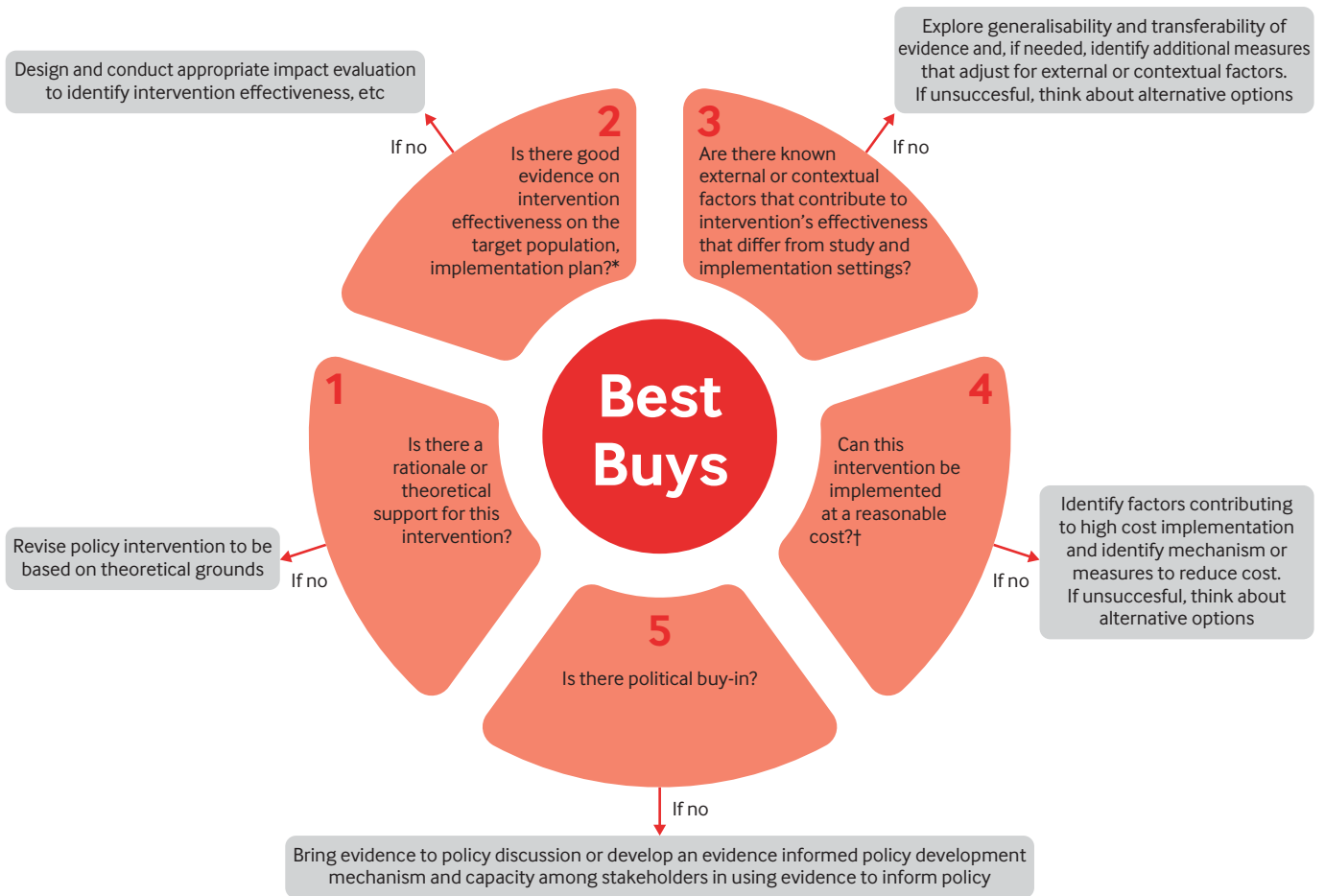
Fig 2 | SEED tool for determining whether an intervention is likely to be worthwhile in a local context. The tool has two sections: the inner circle aims to assist NCD programme managers in thinking critically about the intervention and the outer boxes provide recommendations for strengthening the evidence base. *Implementation=dosage, frequency, duration, coverage, etc, †Compared with the cost of implementing a similar programme in other settings or the costs in the economic evaluation studies used to decide to implement the intervention

evidence generated elsewhere to local settings is not straightforward, 14 22 23 25 we suggest using a scrutiny sequence starting with an initial environmental scan of the economic evidence (high or low income, organisation of healthcare, local prices, etc), followed by a data transferability assessment (see web supplement). 19 26 An institutional hub of national or regional technical expertise could support NCD managers in obtaining a clearer understanding of the local implications for health technology and transferability assessment.